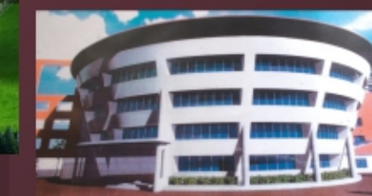
NMMC SCHOOL - KOPARKHAIRANE