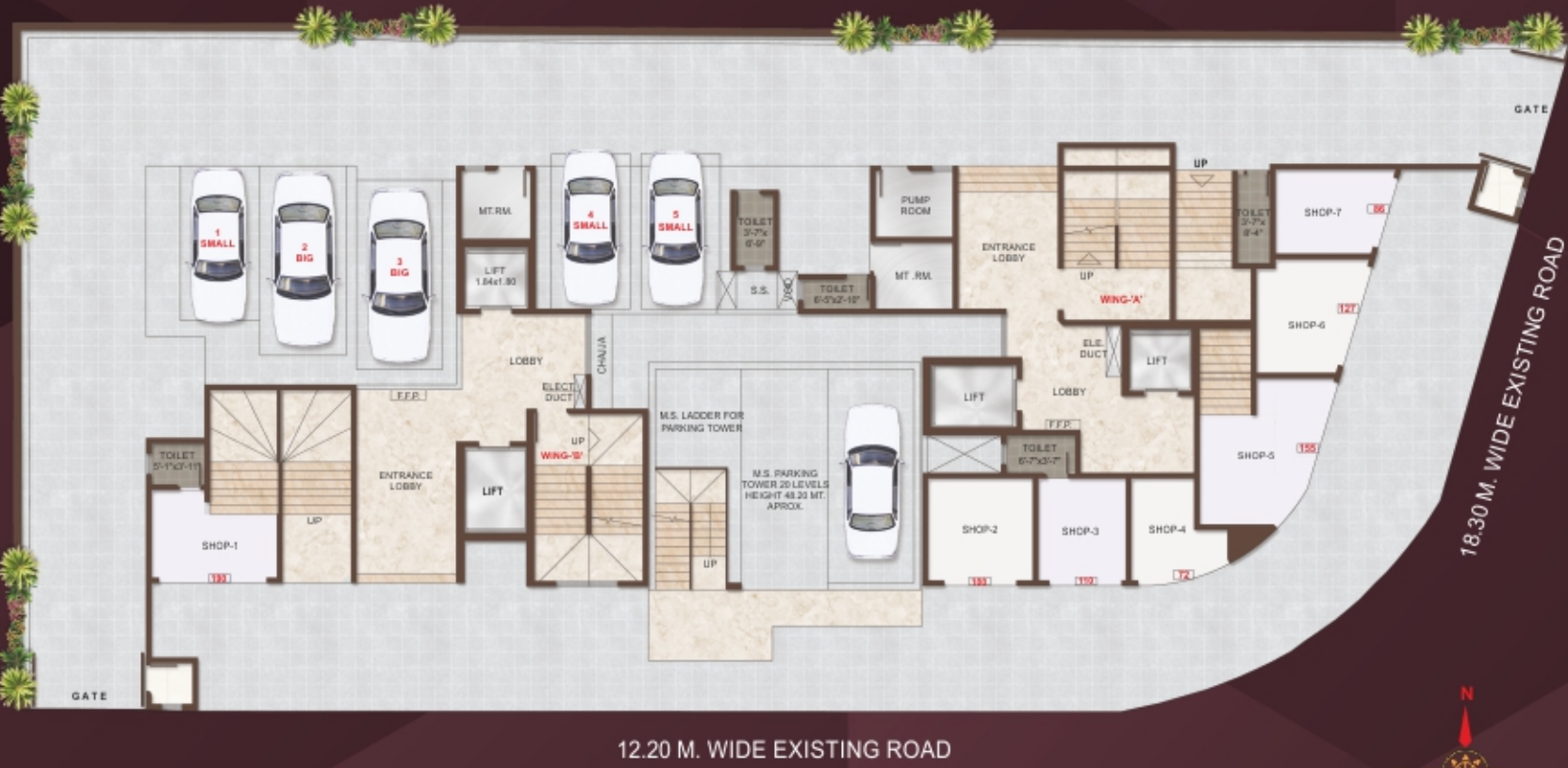
GROUND / STILT FLOOR PLAN