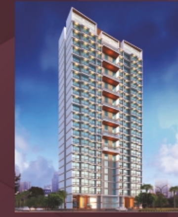
SAI PRASAD - VIKHROLI