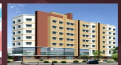
HOSTEL BUILDING - KURLA

And done other Projects such as Roads, Bridges, Water Supply Projects, Huge water Tanks & other Infra contracts