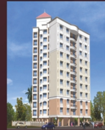
GANGA TOWER - CHEMBUR