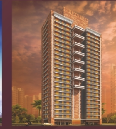
MANORANJAN - VIKHROLI