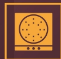
COOK TOP & CHIMNEY