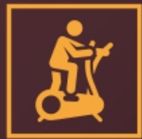
GYM & FITNESS CENTRE ON 21ST FLOOR