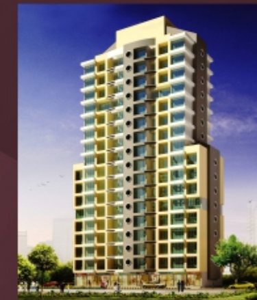
ADARSH AVENUE - VIKHROLI