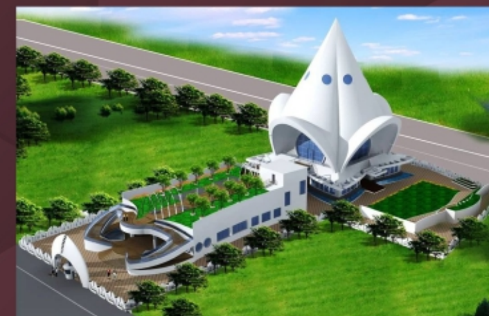
DR. BABASAHEB AMBEDKAR MEMORIAL - AIROLI