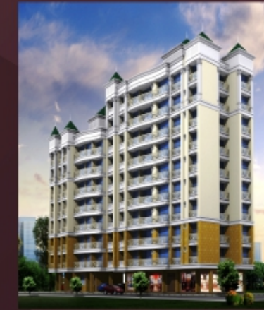
KAMBODHI - CHEMBUR