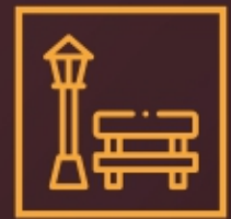
SENIOR CITIZEN SIT OUT