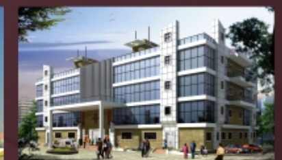
MCH HOSPITAL - BELAPUR