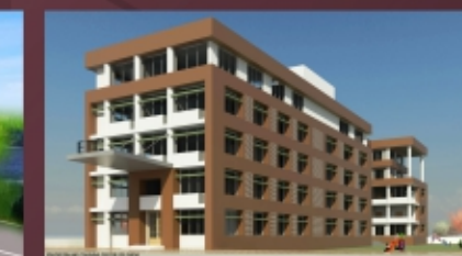
ETC SCHOOL - VASHI