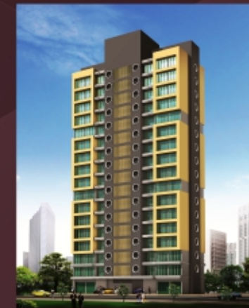
VIDYA DARSHAN - VIKHROLI