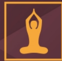
YOGA & MEDITATION