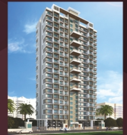
SUYOG SIGNATURE - VIKHROLI