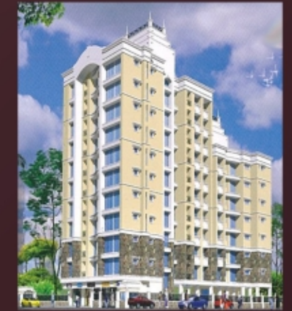
VRUSHALI VILLA - CHEMBUR