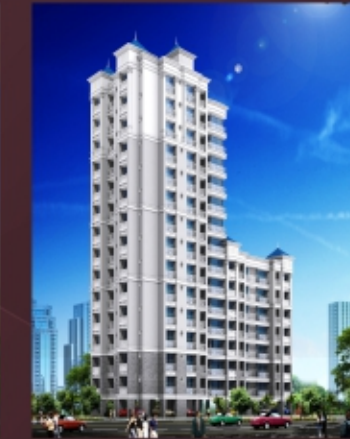
OM SHRI SHANTI - CHEMBUR