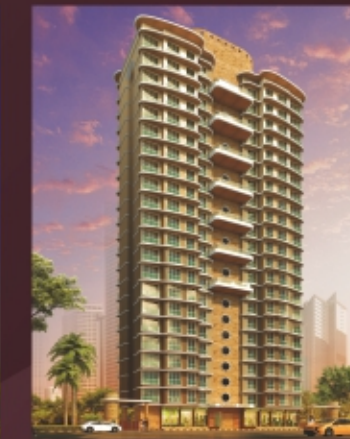
PURNIMA PRIDE - VIKHROLI